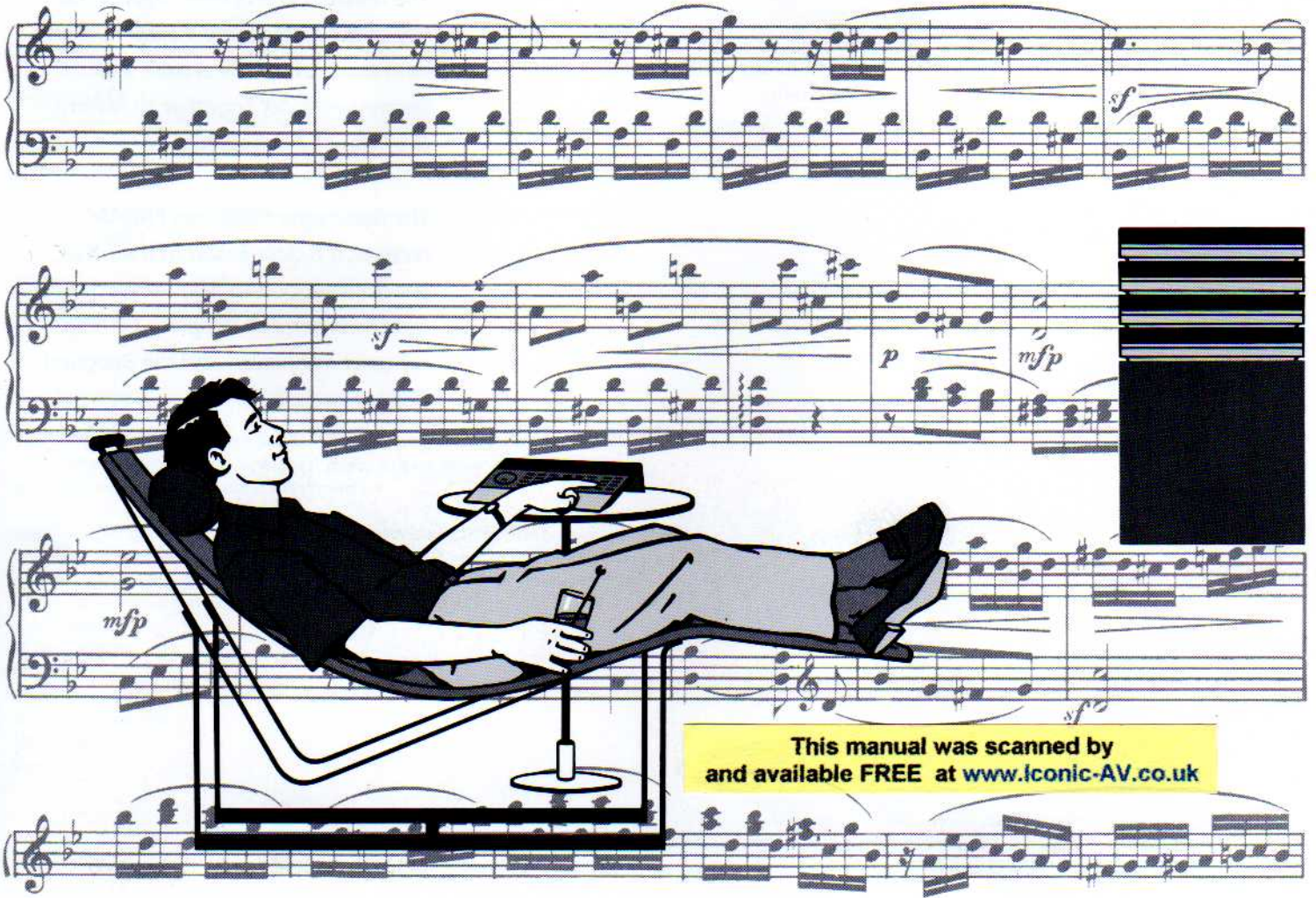
Beogram CD 6500