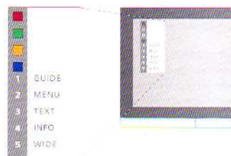
Example of a Set-top Box Controller menu – The Beo4 buttons are shown to the left on the menu and the set-top box buttons are shown to the right.

When set-top box is selected as source, press MENU twice to bring up the television's main menu.